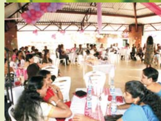
Mothers' Day Tea Party