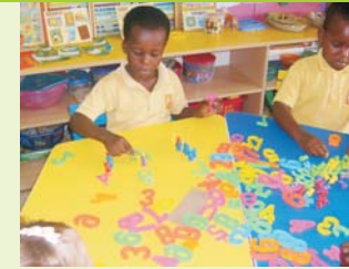
Counting numbers using a variety of manipulatives

Pre-School The Pre-Kg Students are happy to be back in school after the holiday and are currently inquiring into an exciting unit titled, “A Living Resource”. They will