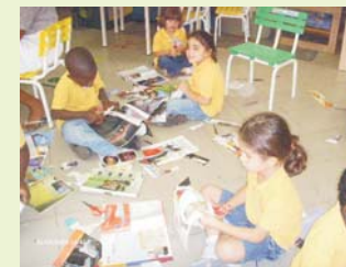
Sorting out pictures of living and non-living things

In Math, they are continuing to broaden and strengthen their addition and subtraction skills, as well as learning how to go about guessing and estimating quantities. They are also learning how to represent a variety of information on graphs.