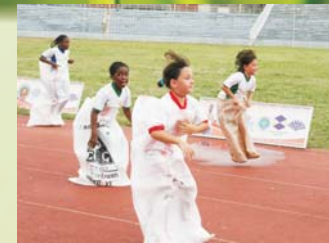
Jnr. & Snr. School Sports Day