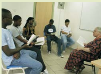
An interactive Literature session

In English Language the Senior School Year 2 students have been learning to create characters by direct description a representation of their actions from which readers can draw their own conclusions. They have also been improving their interpretive skills which are emphasized in the Checkpoint exams. The students have also been introduced to editing which involves distinguishing essential from non-essential information, another important Checkpoint skill.