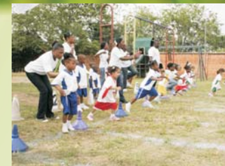
Pre-School Sports Day