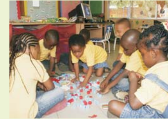
Sorting letter cubes to form words.

In Language, the Pre-Kg students are now more aware of phonic sounds and they can confidently and independently decipher words they come across, both inside and outside classroom, by using their sounding and blending skills.