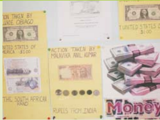
Display of Currency notes and coins from different countries.

The students have also been learning about the evolution of money in Nigeria and are coming up with a display of various forms of money, including cowries and manilas.